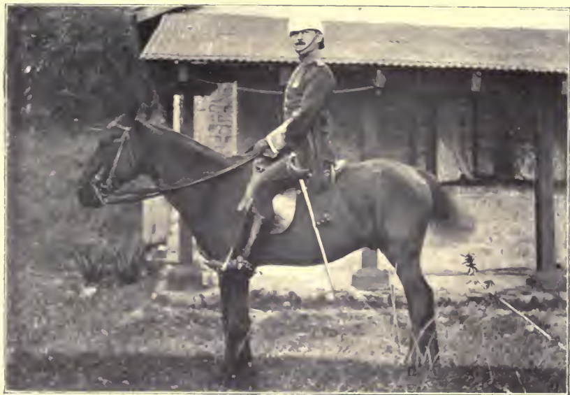
" I WAS MOUNTED ON A COUNTRYBRED PONY."